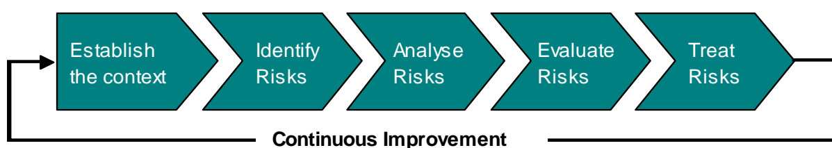
Diagram 1 – Risk management approach

The following section explains the main elements of a preliminary risk assessment for audits and reviews.