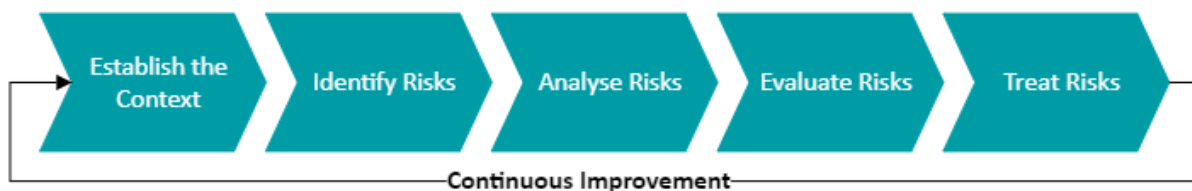
Diagram 1 – Risk management approach

The following section explains the main elements of a preliminary risk assessment for audits and reviews.