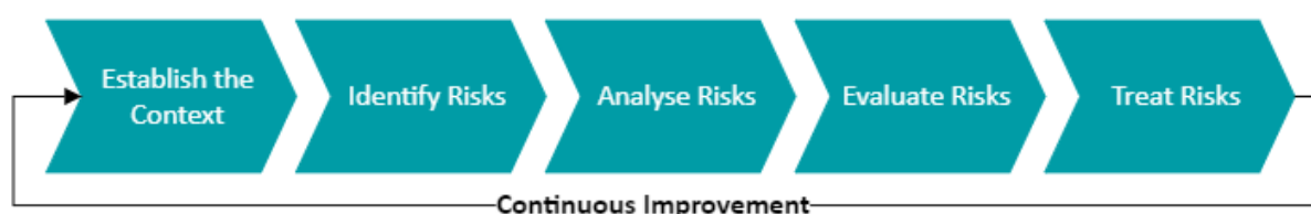
Diagram 1 – Risk management approach

The following section explains the main elements of a preliminary risk assessment for audits and reviews.