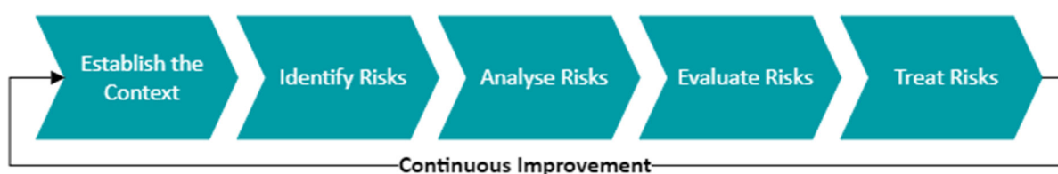
Diagram 1 – Risk management approach

The following section explains the main elements of a preliminary risk assessment for audits and reviews.