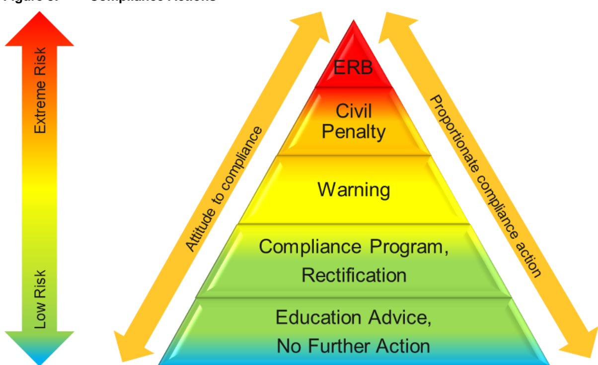
Figure 3: Compliance Actions

statutory compliance actions available to it under the WEM Rules and the WEM Regulations (e.g., warnings, civil penalties and/ or commencement of proceedings before the ERB), and also administrative responses, such as providing education advice and seeking a voluntary compliance program (refer Figure 3).