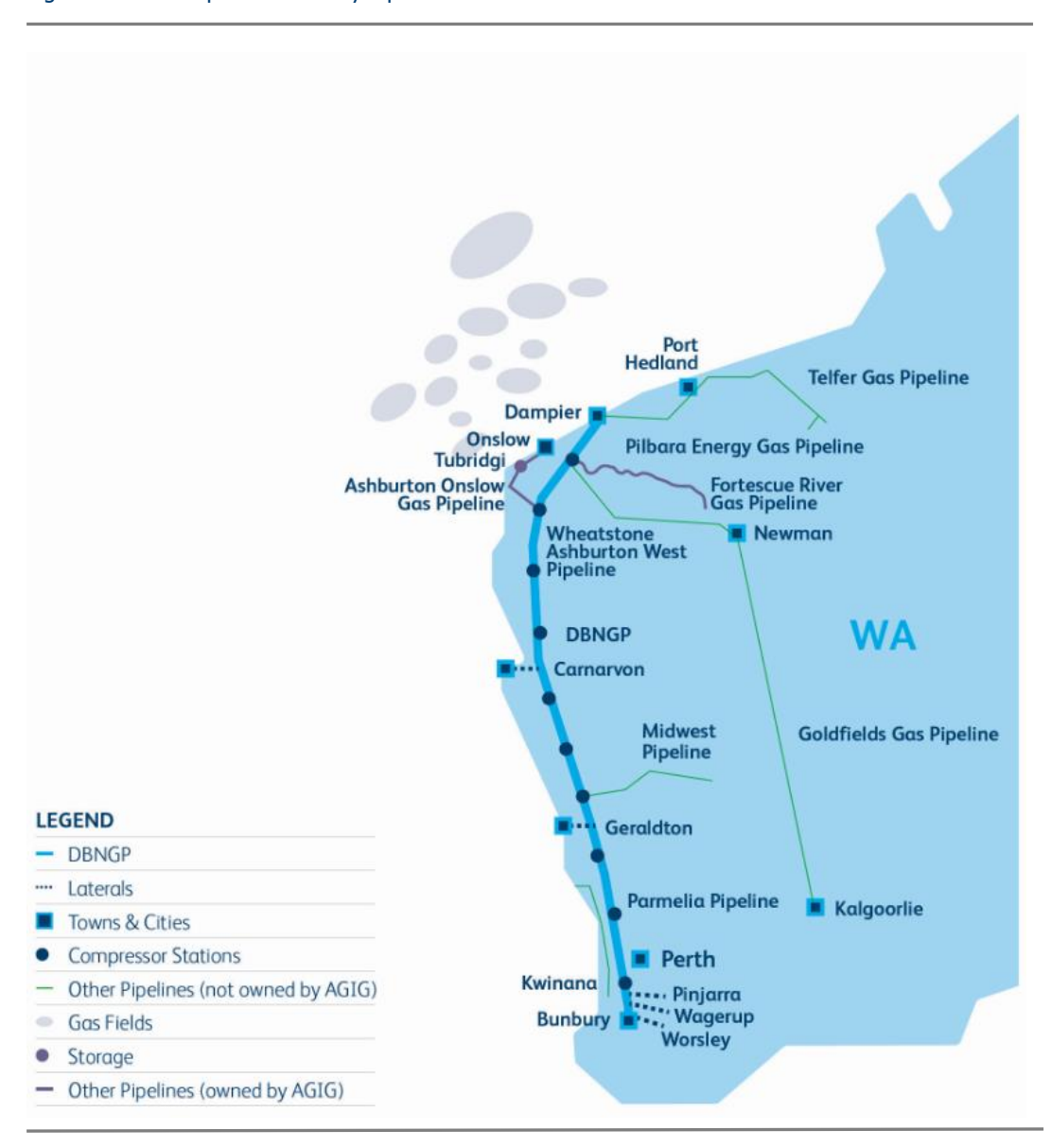
Figure 1 The Dampier to Bunbury Pipeline

It stretches almost 1,600km, linking the gas fields located in the state's northwest directly to mining, industrial and commercial customers, and ultimately via distribution networks (not owned by AGIG) to residential customers in Perth.