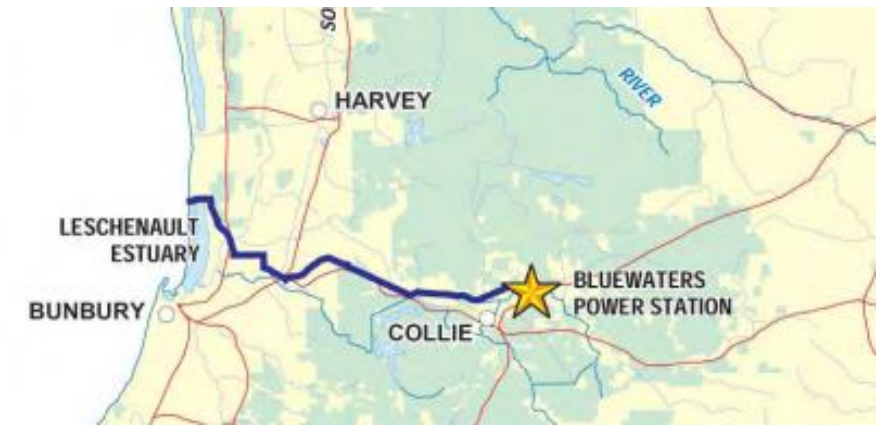
Figure 2 Bluewaters Power Station Site Location

The Bluewaters Power Station assets consists of: