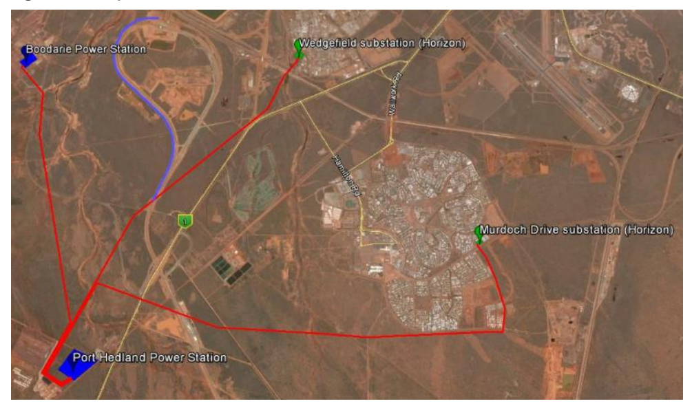
Figure 1 – Map of ADEWAP Network

The Port Hedland Power Station's two sites of generation at Port Hedland and Boodarie sit around 5km apart, however they are configured, operate and are dispatched as a single power station. The ADEWAP Port Hedland Power Station has an operational capacity of around 175MW.