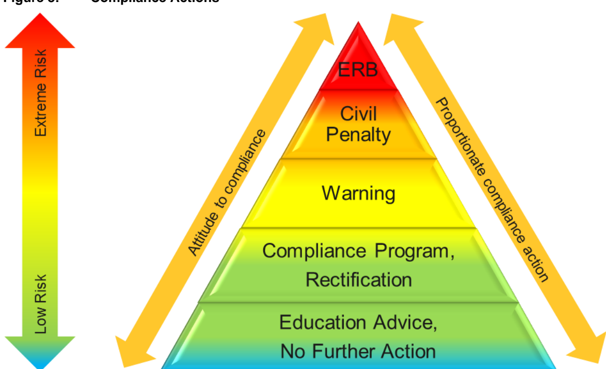
Figure 3: Compliance Actions