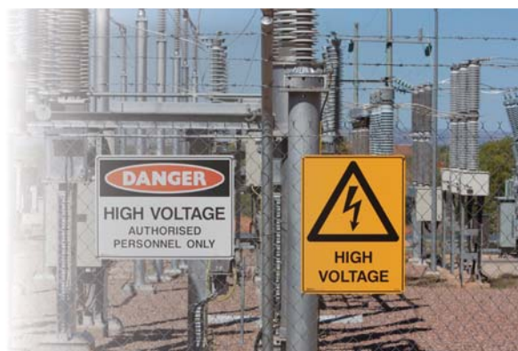
State Underground Power

likely that more SUPP projects could have been provided to additional suburbs for the same amount of funding from public funds. Based on the proportion of benefits that has accrued to each party highlighted in the cost benefit analysis of the SUPP, the ERA has proposed a more flexible approach be adopted, where Western Power contributes an amount equal to the value of its avoided costs for each individual project area – on average between 15 and 35 per cent. The State Government's contribution could vary depending on the property values in each project area with households in higher property value areas paying more while households in areas of lower property values receiving an increased payment toward any SUPP project from Government.