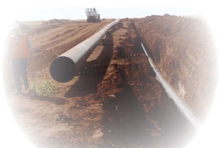
Dampier to Bunbury Natural Gas Pipeline

For the purpose of this access arrangement period, until 31 December 2015, the tariffs that are determined in this final decision will not apply unless a user of the pipeline is offered the regulated service at the regulated tariff.